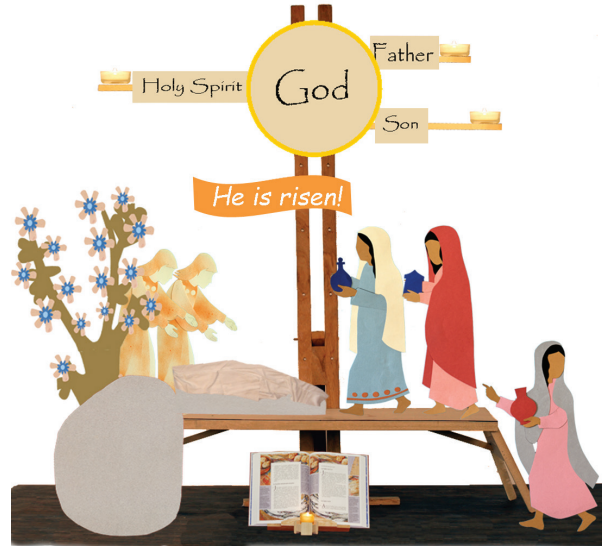
A visual representation of resources used when sharing biblical stories during 'Come, Follow Me' sessions.