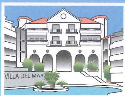
Villa Del Mar Hotel (****)

Only a 2-hour bus transfer from Malaga Airport, the newly built Villa Del Mar offers the last word in four-star holiday comfort. This beautiful 300-bedroom complex boasts no less than three swimming pools, a golf course, a magnificent leisure centre and two award-winning restaurants. All rooms have en suite bathrooms, and the balcony rooms have breathtaking views of the gorgeous Mediterranean Sea.