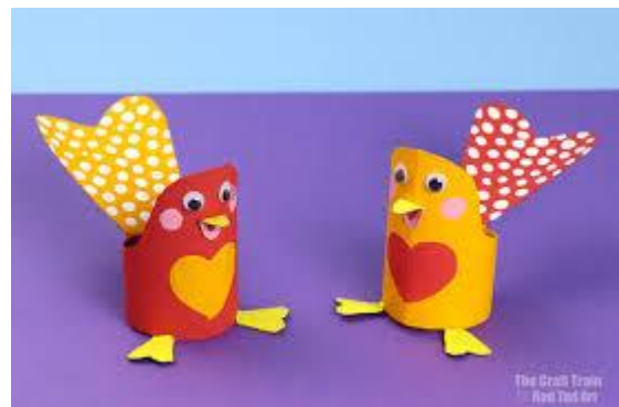
This little bird is made from scraps of fabric. You could use different pieces of paper – newspaper, magazine paper or scraps of wrapping paper.